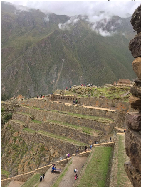
Terraces in Ollantaytambo leading to sun temple