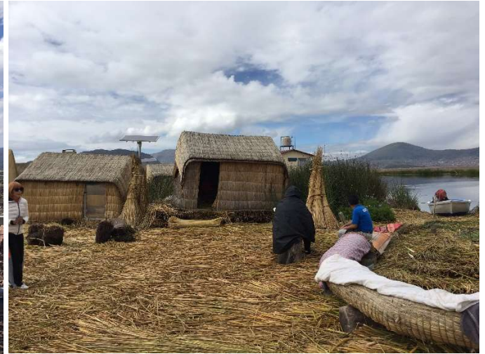
Cabins on reed islands on Lake Titicaca